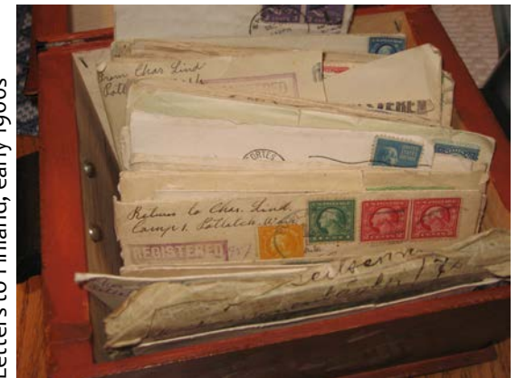
Letters to Finland, early 1900s

A Dramatized Family History in which the author relates the experiences of her immigrant parents and their community in the early logging camps of northwest Washington.